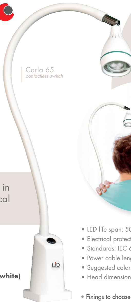
Carla 65 contactless switch

Ideal as an examination lamp in general medicine for all medical specialities, nurses.